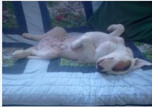
Rascal - Professional Pet Sitting Etc. Pet Sitting NH, Dog Walking NH, Pet Care NH, Mid Day